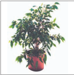
Ficus Benjamin EUR 35.00 Code 016.600.030.000 (60x60x220 cm)