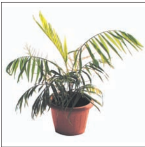
Phoenix canariensis EUR 23.00 Code 016.600.090.000 (50x50x100 cm)