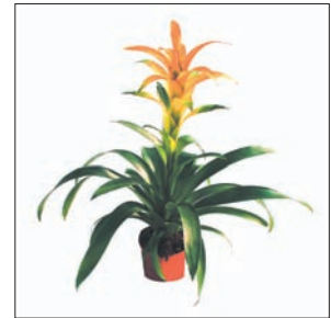
Guzmania Hilda EUR 10.00 Code 016.600.230.000 (25x25x80 cm)