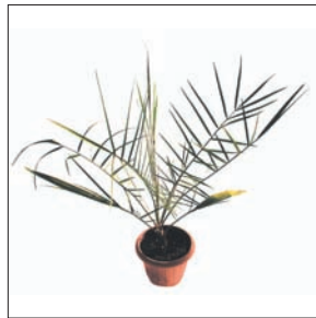
Cocos weddeliana (Coconut) EUR 10.00 Code 016.600.080.000 (35x35x80 cm)