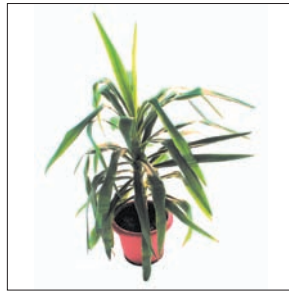
Dracena EUR 7.00 Code 016.600.100.000 (45x45x100 cm)