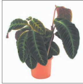
Calathea ornata EUR 7.00 Code 016.600.190.000 (30x30x40 cm)