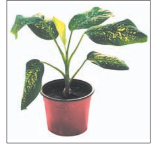
Dieffenbachia camilla (Sugar Cane) EUR 7.00 Code 016.600.200.000 (25x25x50 cm)