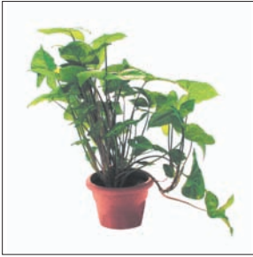
Syngonium podophyllum EUR 7.00 Code 016.600.170.000 (35x35x50 cm)