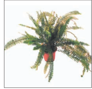
Pteridophyta (Bracken) EUR 7.00 Code 016.600.070.000 (50x50x70 cm)