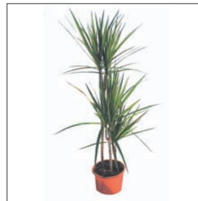
Dracena marginata EUR 10.00 Code 016.600.110.000 (25x25x120 cm)