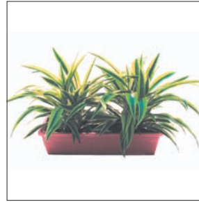
Window box Dracena fragrans EUR 15.00 Code 016.600.290.000 (70x25x120 cm)