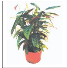
Maranta leuconeura EUR 10.00 Code 016.600.050.000 (40x40x100 cm)