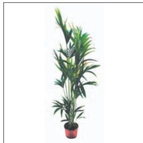
Howea forster EUR 23.00 Code 016.600.130.000 (45x45x180 cm)