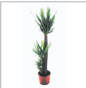
Yucca elephantipes (Yucca) EUR 15.00 Code 016.600.120.000 (35x35x130 cm)