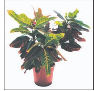
Codieum EUR 10.00 Code 016.600.310.000 (60x60x90 cm)